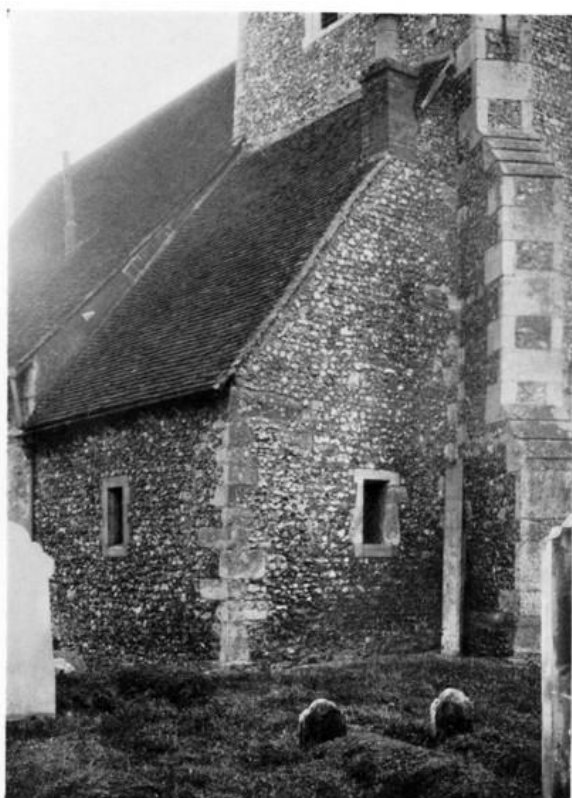
ANCHORAGE AT HARTLIP