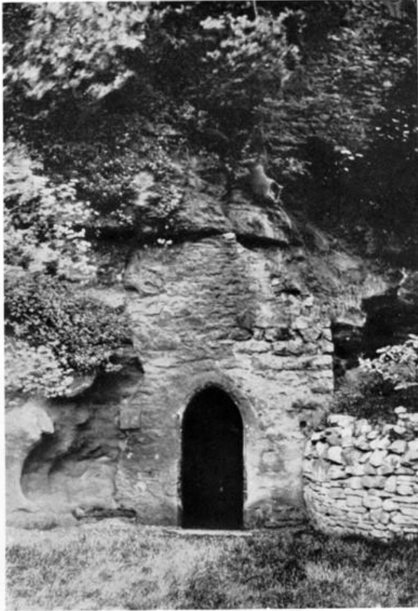
REDCLIFFE HERMITAGE, BRISTOL

Plate XXV : Redcliffe Hermitage, Bristol.